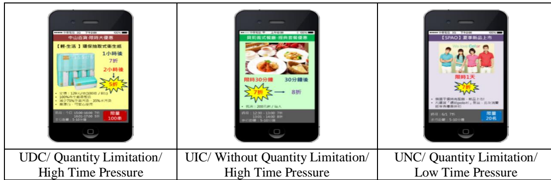
Fig. 2 Sample experimental material

results enable us to identify products that meet the individuals' general needs. The second stage is to determine the levels of time pressure and product limitation to induce the perceived scarcity. Questions on the boundary conditions for quantity and time limitations will be asked. Samples of experimental material are shown in Figure 2. Survey questionnaires are designed to collect data after the subject views the promotional material. The definition of constructs and reference of measurement items are shown in Table 1.